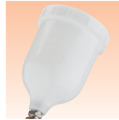
Gravity cup pt. no. GFC-501