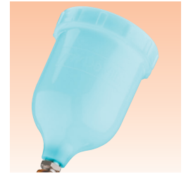
Gravity cup (Blue polyester) pt. no. GFC-511 for difficult fluids.