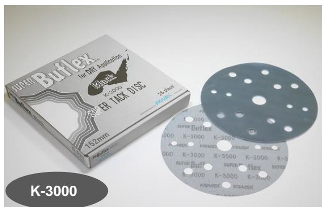
Super Buflex Disc K-3000(Black)

Beautiful finishes can be achieved in much less time, now with DRY sanding !