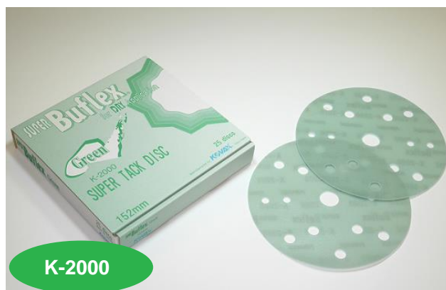
Super Buflex Disc K-2000(Green)

SUPER Buflex , a unique, dry sanding integrates an ultra-flexible latex abrasive disc and a exclusive soft pad that cuts fast with a shallow scratch pattern which is easier to polish than grit 3000 or finer. Due to it's flexibility, Buflex can polish perfectly without altering original paint texture. Extremely uniform and shallow scratch pattern are the main reasons why Buflex system can produce beautiful finishes in much less time . Now, you can achieve "Zero Water" system upto Super Buflex !